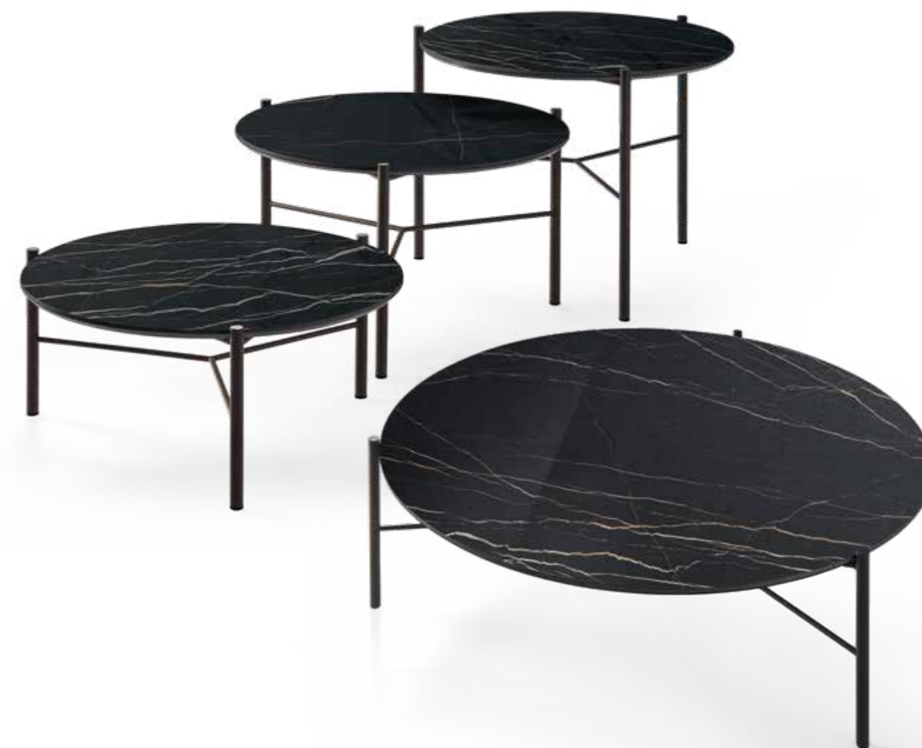
JACK_top ceramica tavolini, ø cm 60x h 30, ø cm 60x h 36, ø cm 60x h 46, ø cm 100x h 30, base: verniciato nero, top: ceramica Portoro opaco.