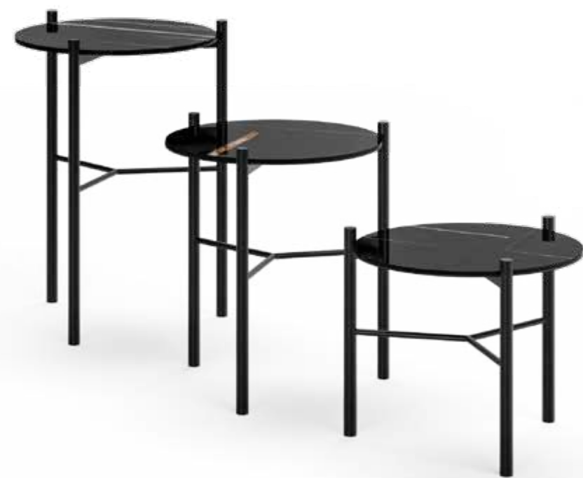
JACK_top ceramica tavolini, ø cm 36x h 31, ø cm 36x h 41, ø cm 36x h 51, base: verniciato nero, piano: ceramica Sahara Noir lucido.