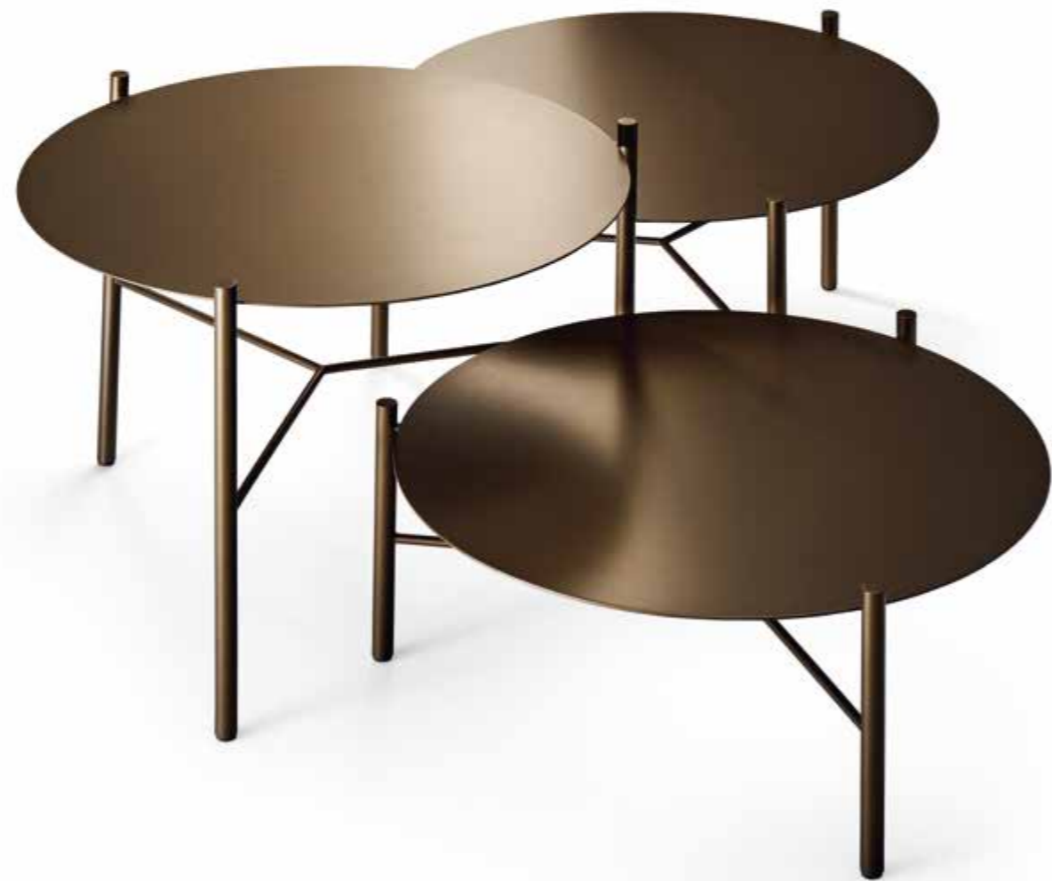
JACK_top metallo tavolini, ø cm 60x h 46, ø cm 60x h 36, ø cm 60x h 30, verniciato bronzo.