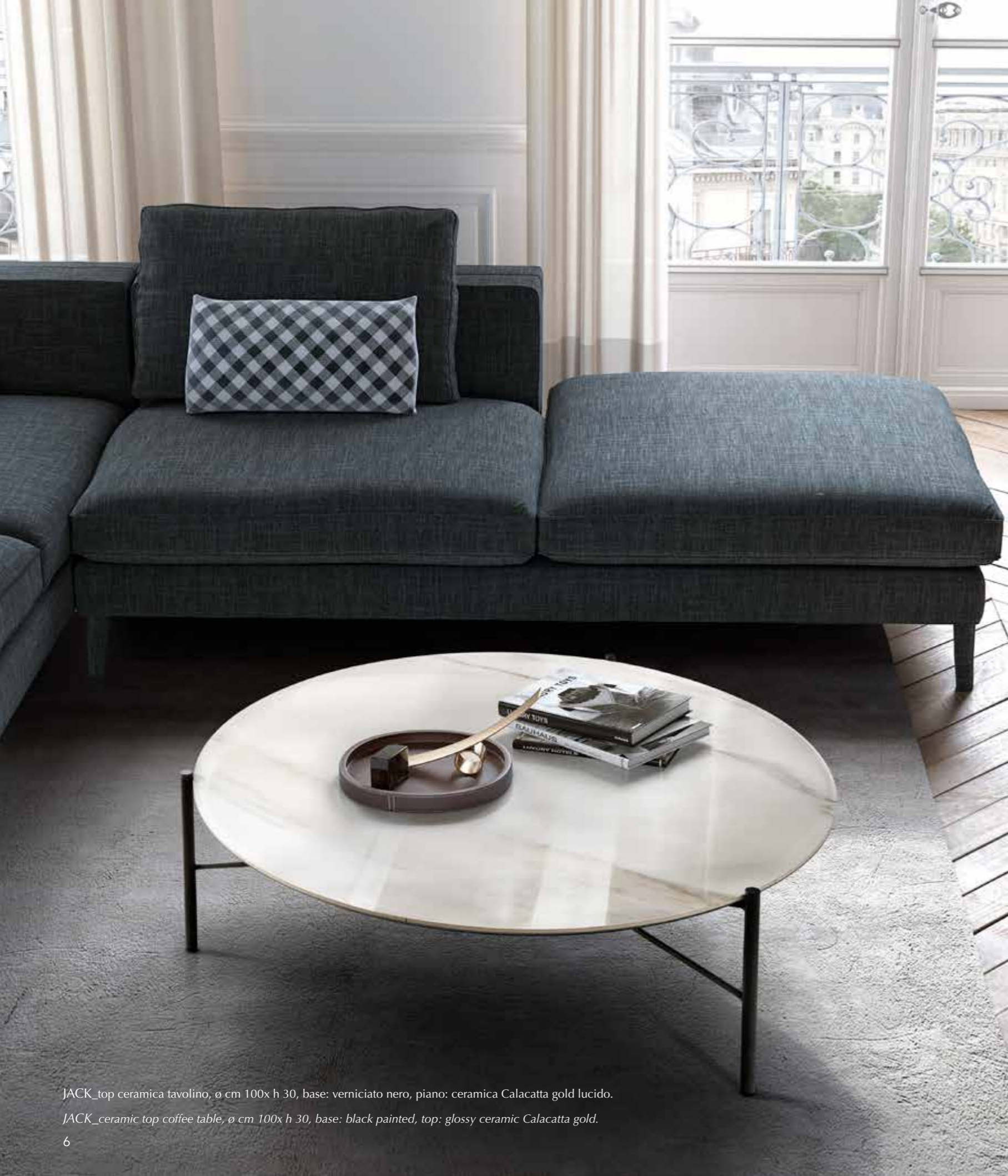
JACK_top ceramica tavolino, ø cm 100x h 30, base: verniciato nero, piano: ceramica Calacatta gold lucido.