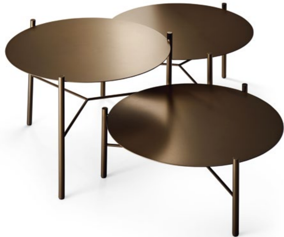
JACK_top metallo tavolini, Ø cm 60x h 46, Ø cm 60x h 36, Ø cm 60x h 26, verniciato bronzo.