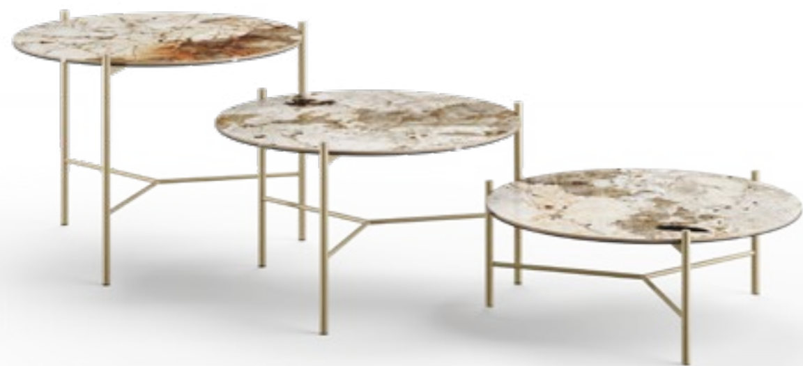
JACK_top ceramica tavolino, set Ø cm 60x h 26, Ø cm 60x h 36, Ø cm 60x h 46, base: verniciato titanio, piano: ceramica Patagonia lucido.