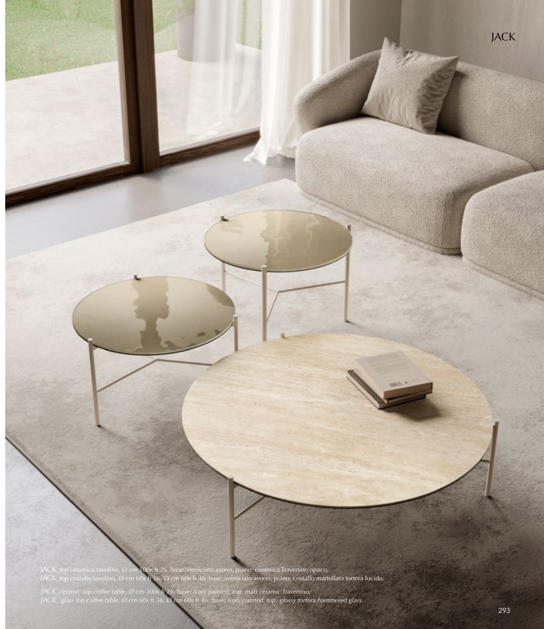
JACK_top ceramica tavolino, Ø cm 100x h 26, base: verniciato avorio, piano: ceramica Travertino opaco, JACK_top cristallo tavolino, Ø cm 60x h 36, Ø cm 60x h 46, base: verniciato avorio, piano: cristallo martellato tortora lucido.