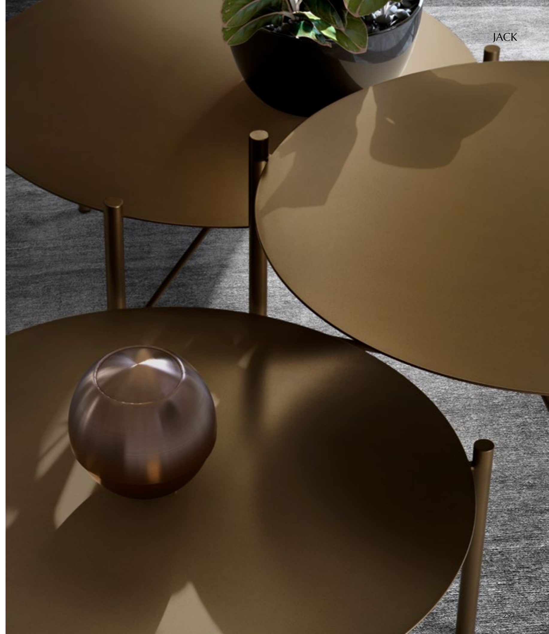
JACK_metal top coffee tables, Ø cm 60x h 46, Ø cm 60x h 36, Ø cm 60x h 26, bronze painted.