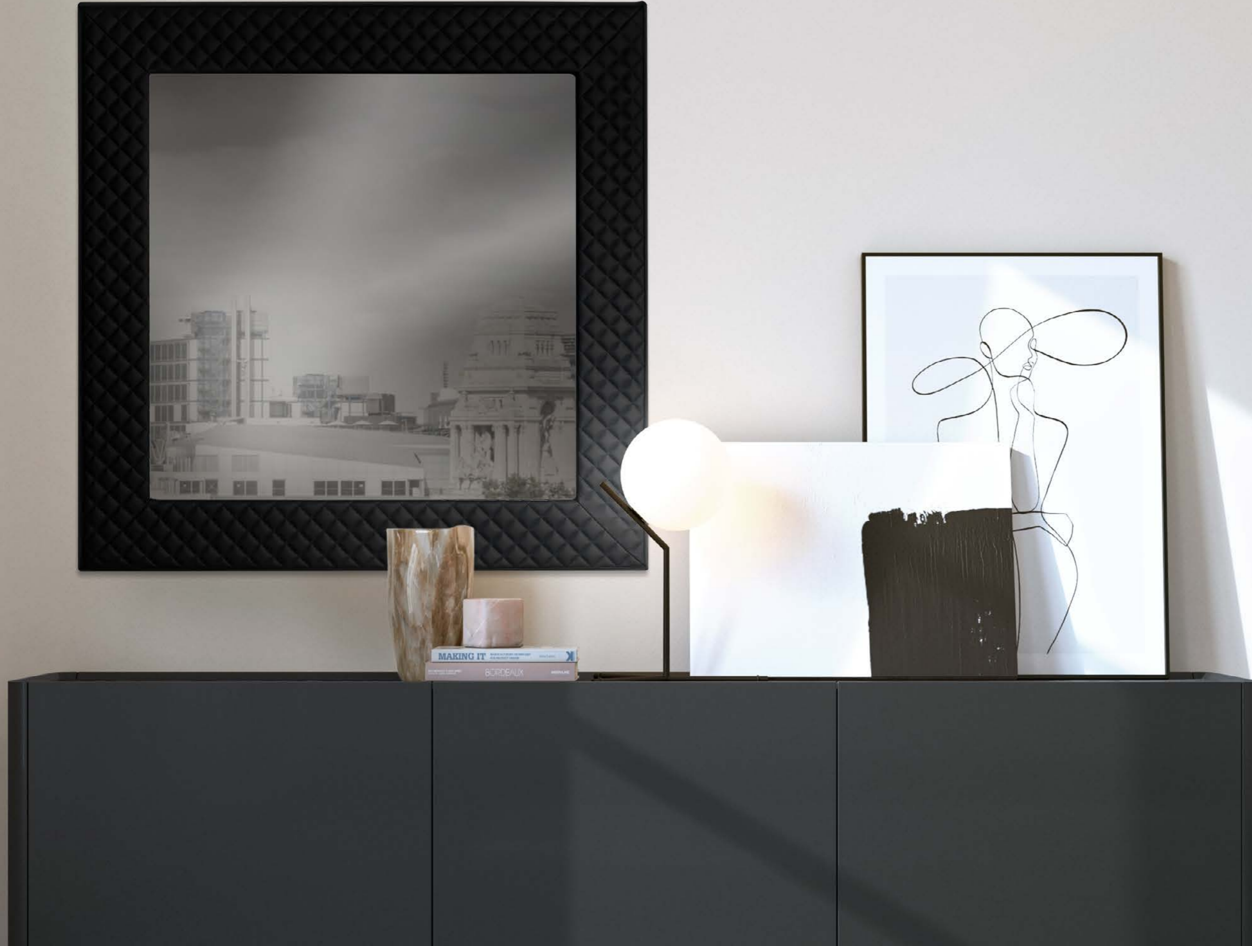
PRISMA specchio, cm 120x120, cornice: pelle 5300 nero. ALMA madia, cm 220x45x h 75, laccato antracite, top: frassino nero. PRISMA mirror, cm 120x120, frame: leather 5300 nero. ALMA sideboard, cm 220x45x h 75, anthracite lacquered, top: black ash.